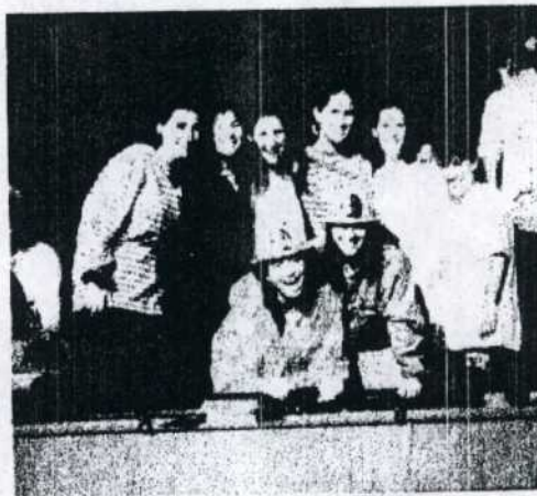
From the Morasha fire truck 'מקור מַכַּבִּיָּה Break-Out