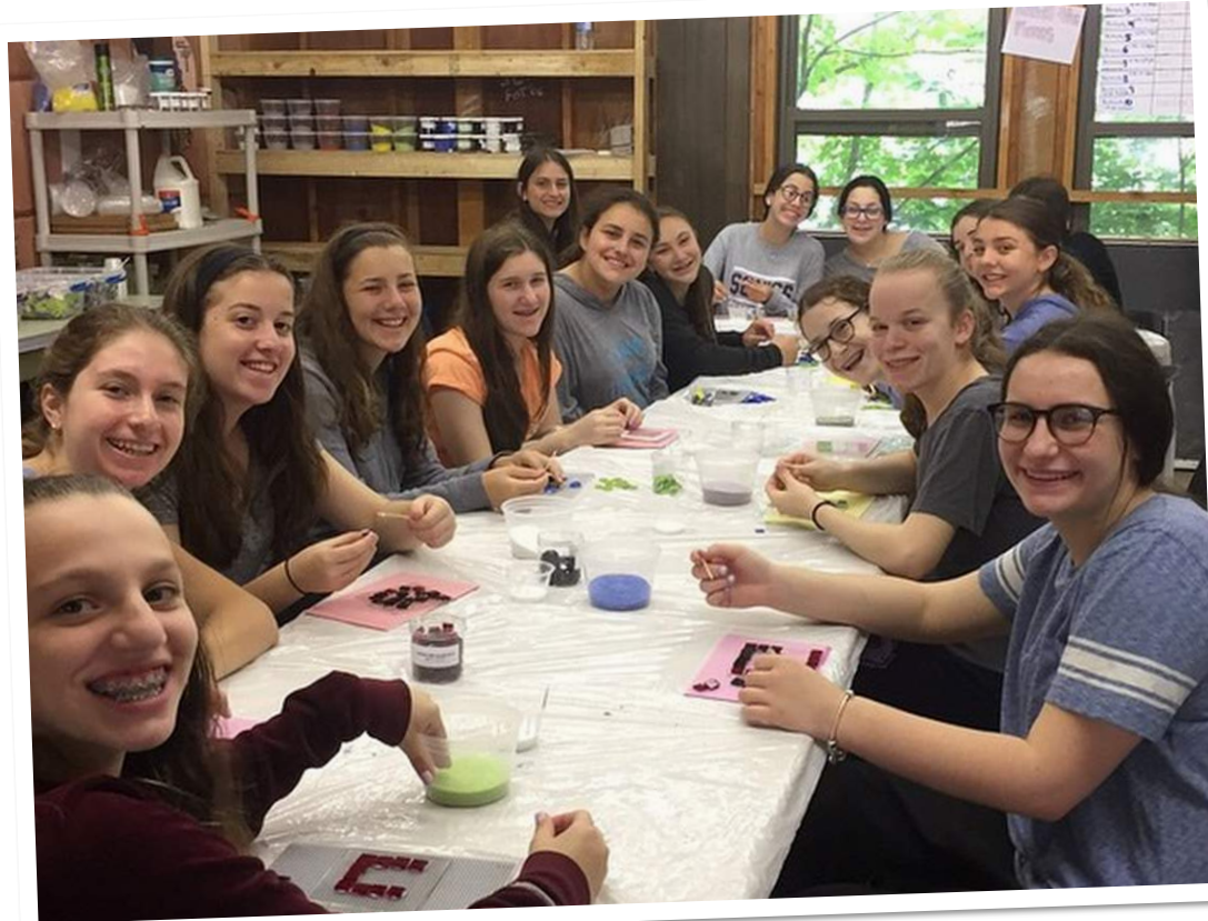
ALUFOT try their hand at glass fusing, one of many new activities this summer