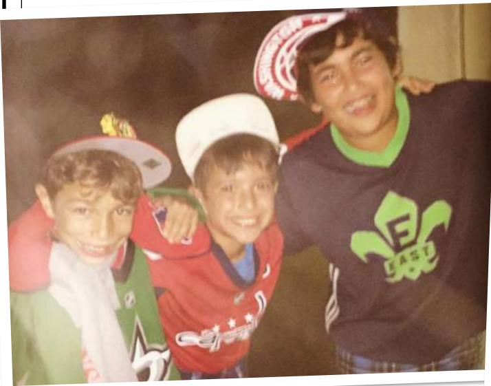
NIITZI BOYS make some noise at Purim in July and arts and crafts