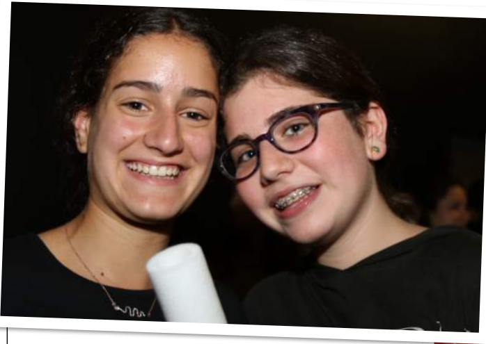
MANHIGOT and ILANOT all decked out in black and red for opening night