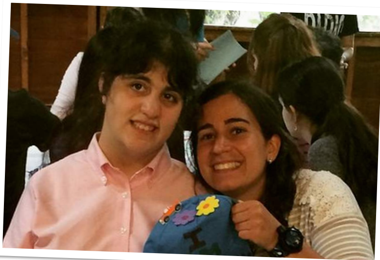
YACHAD designs hats during chesed