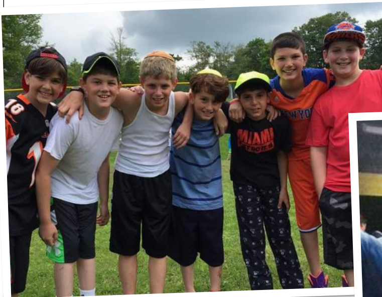
YOUNGER SHTILIM are all smiles