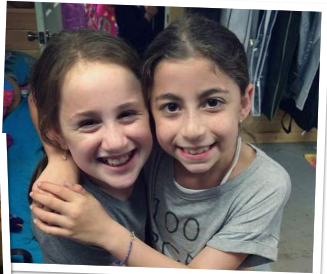
NITZIS get their first taste of Morasha