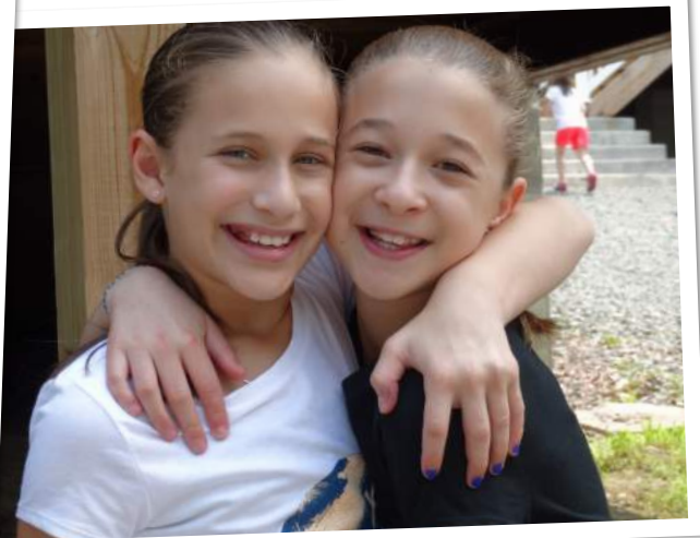
OLDER SHTILIM happily reunite with camp friends!