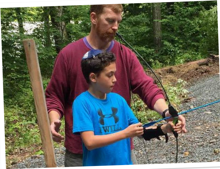
OLDER SHTILIM take a shot at archery