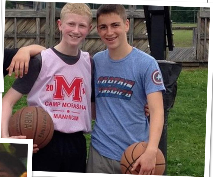
ALUFIM get their basketball leagues started