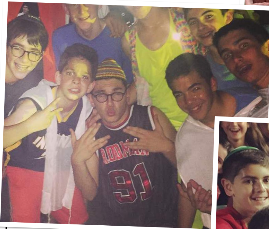
Manhigim (top) celebrate Purim in July, and the Ilanot (right) enjoy the Lipa Schmeltzer concert