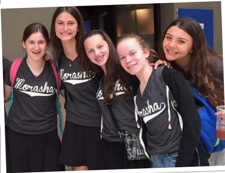
ALUFOT at Six Flags