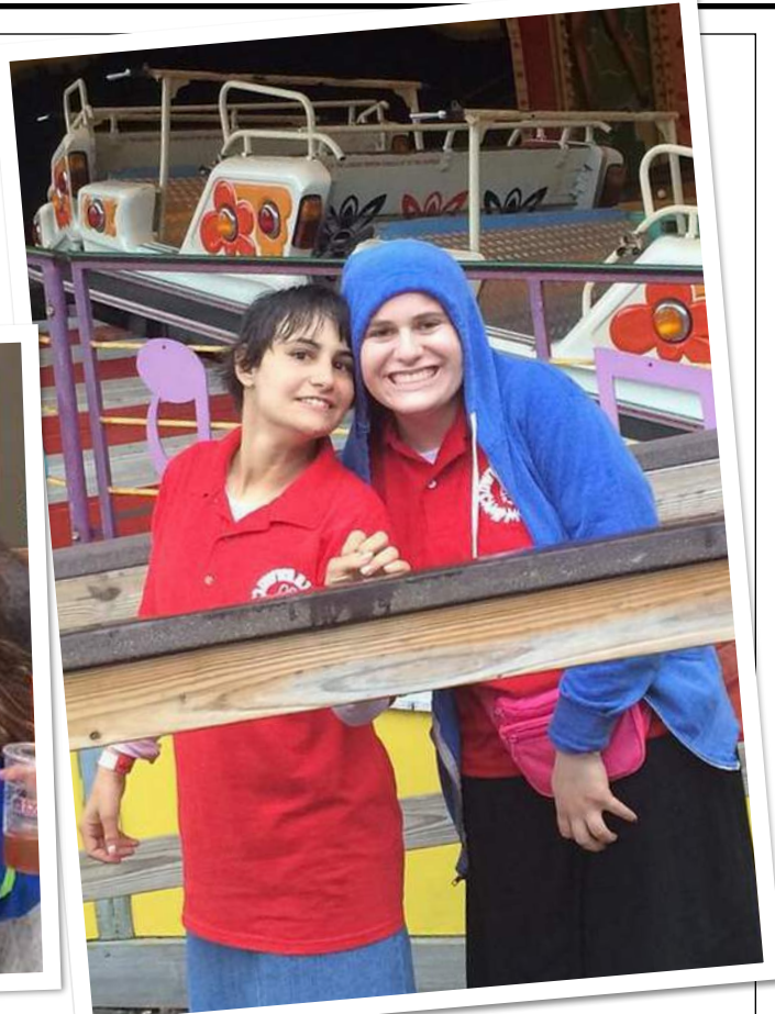
Yachad enjoying Trip Day