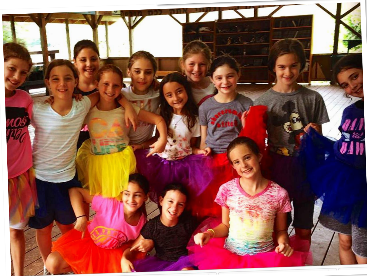
NITZIS go all out for “Tutu Tuesdays”