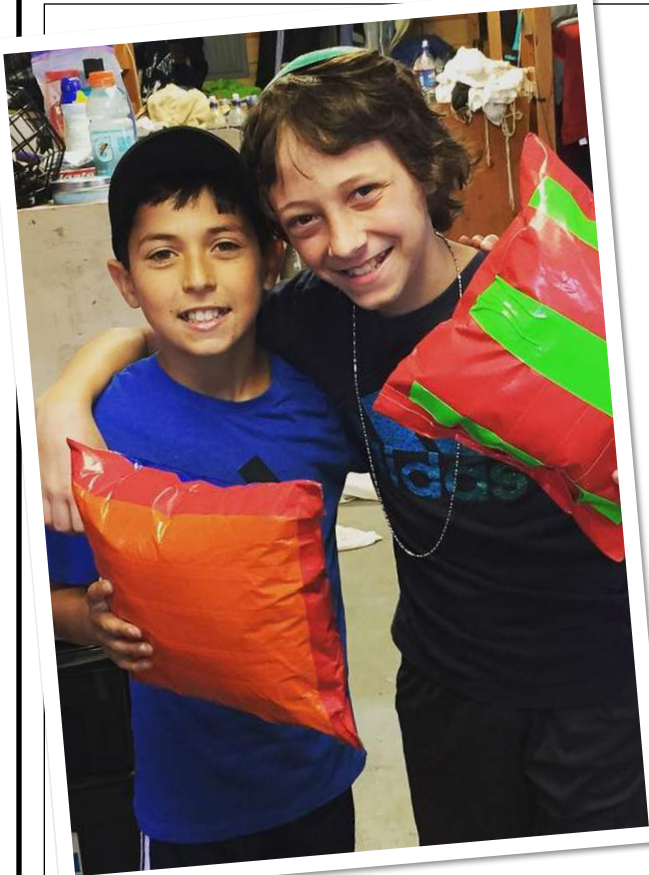
OLDER SHTILIM do ductigami