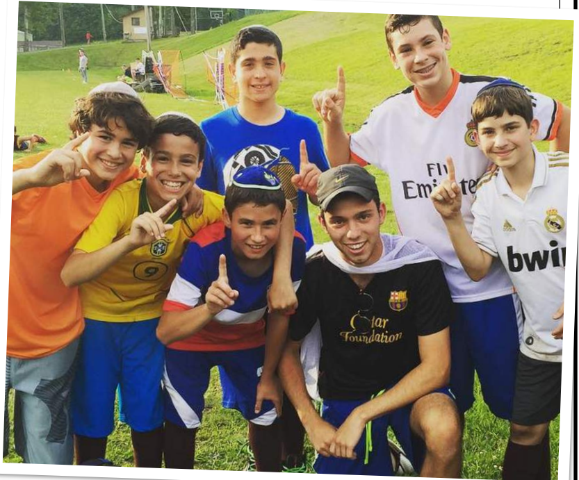
ILANOT FIFA Champs are #1