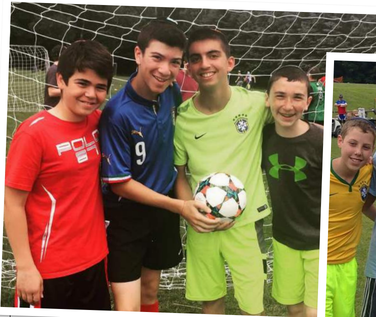
MANHIGIM (left)) and ALUFIM (right) show off their soccer skills during FIFA