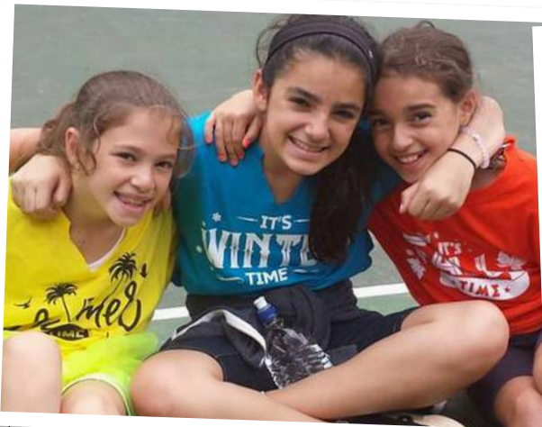
YOUNGER SHTILIM (left) and ILANOT (right) represent the four seasons during “It’s About Time”