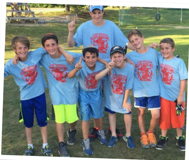
Super Bowl Sunday!