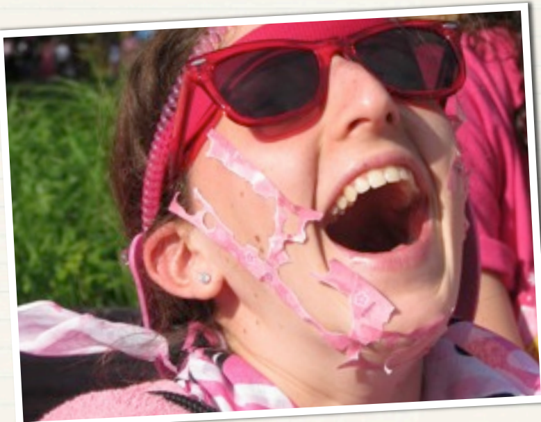
PHOTO OF THE WEEK:

The thing I can't wait for the most is...